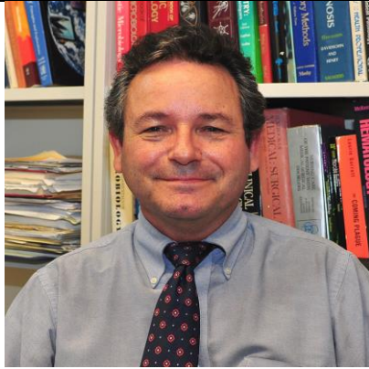
Clinical Adjunct Faculty ~ Lecturers